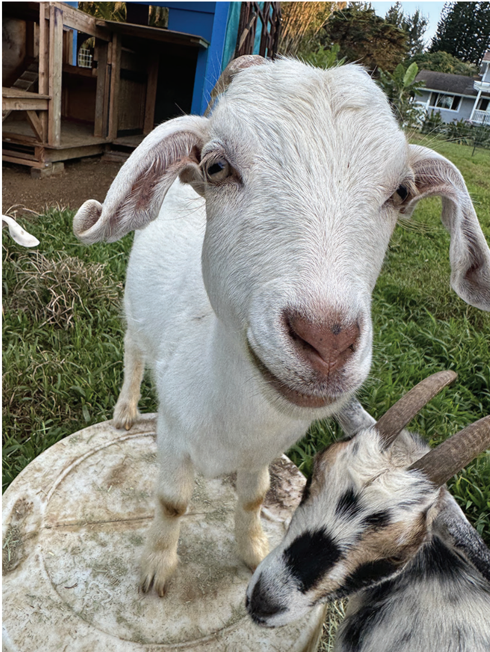
Our Nigerian Goats, Jack & his Mama, Louise

This will be your local convenience store and gas station. Just take a left on E. Kuiaha, then a right at the end of the road. The store will be a long block down on your left.